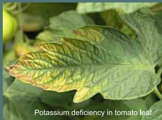
Potassium deficiency in tomato leaf

Compatible to mix with other fertilizers and pesticides